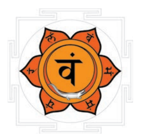
Svadhisthâna (Church of Smyrna)

The Church of Ephesus is a lotus with four splendid petals. This church has the brilliance of ten million suns. The elemental earth of the sages is conquered with the power of this church.