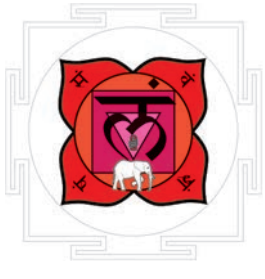
Muladhara (Church of Ephesus)

the brain) is controlled by Neptune. There is an intimate correlation between these two glands, and the Kundalini must connect them with the sacred fire in order to achieve the profound realization.