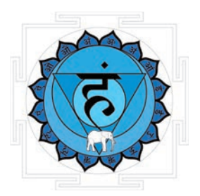
Vishuddha (Church of Sardis)

The second chapter of Revelation deals with the four lower churches of our organism. These four centers are known as fundamental or basic, prostatic, umbilical, and cardiac. Now we shall study the three upper magnetic centers mentioned in Revelation, chapter three. These three upper churches are the Churches of Sardis, Philadelphia, and lastly, Laodicea.