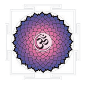
Sahasrâra (Church of Laodicea)

When the Kundalini reaches the height of the pineal gland, the Church of Laodicea opens. This lotus flower has a thousand resplendent petals. The pineal gland is influenced by Neptune. When this Church opens, we receive polyvision, intuition, etc. The pineal gland is intimately related to the chakras of the gonads or sexual glands. The greater the level of sexual potency, the greater the development of the pineal gland. The lesser the degree of sexual potency, the lesser the degree of development of the pineal gland. Uranus in our sexual organs and Neptune in the pineal gland unite to carry us to total realization.