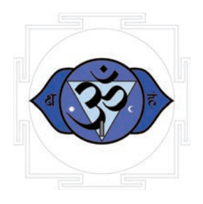
Âjna (Church of Philadelphia)

When the Kundalini reaches the height of the space between the eyebrows, the Church of Philadelphia opens. This is the eye of wisdom. The Father who is in secret dwells in this magnetic center. The chakra at the space between the eyebrows has two fundamental petals and many splendorous radiations. This center is the throne of the mind. No true clairvoyant says he is one. No true clairvoyant says, "I saw." The clairvoyant initiate says, "We consider."