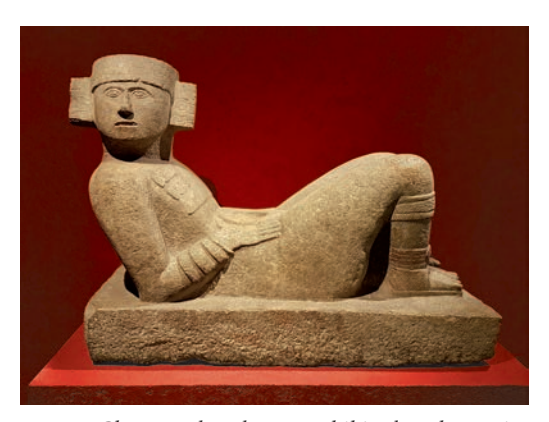
Mayan Chac Mool sculpture, exhibited at the National Museum of Anthropology in Mexico.

While in the Chac Mool position, the aspirant imagines that the energy of the Sun enters through the solar plexus making it vibrate and rotate from left to right, like the hands of a clock when we look at it from the front. This exercise can be done for one hour daily. The basic mantra of this magnetic center is the vowel U . This vowel can be vocalized by elongating the sound in this way: UUUUUU. A well awakened solar plexus marvelously animates all the chakras of the organism. Thus, this is how we prepare ourselves for initiation.