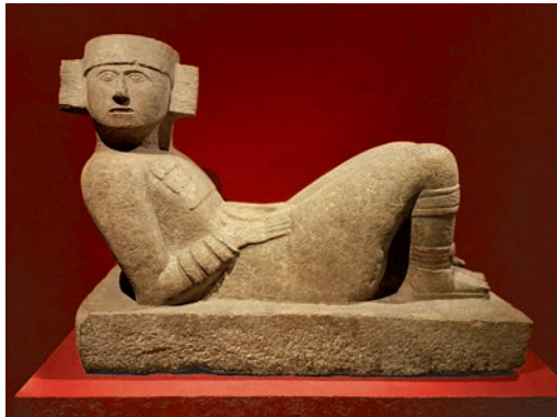
Mayan Chac Mool sculpture, exhibited at the National Museum of Anthropology in Mexico.

While in the Chac Mool position, the aspirant imagines that the energy of the Sun enters through the solar plexus making it vibrate and rotate from left to right, like the hands of a clock when we look at it from the front. This exercise can be done for one hour daily. The basic mantra of this magnetic center is the vowel U . This vowel can be vocalized by elongating the sound in this way: UUUUUU. A well awakened solar plexus marvelously animates all the chakras of the organism. Thus, this is how we prepare ourselves for initiation.