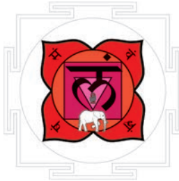
Muladhara (Church of Ephesus)

the brain) is controlled by Neptune. There is an intimate correlation between these two glands, and the Kundalini must connect them with the sacred fire in order to achieve the profound realization.