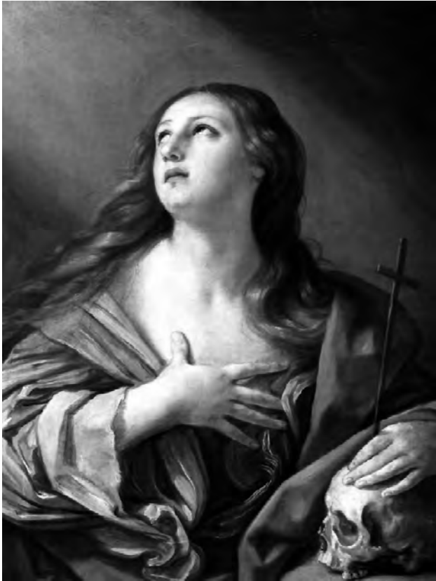
Magdalena penitente Guido Reni